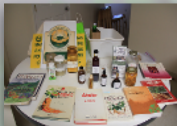
Value-added products and herbal literature