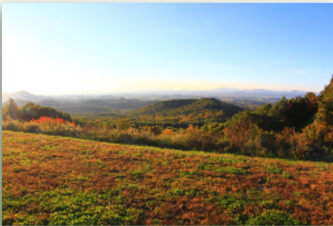
The hardwood forests of southern Appalachia are perfect for growing medicinal woodland herbs.

Southwest Virginia and Northeast Tennessee have an abundance of forested mountains that can be used to grow medicinal herbs such as goldenseal, ginseng, ramps, and more. Forest farmers looking to cultivate these