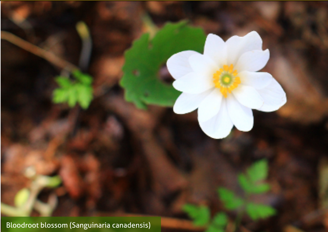
Bloodroot blossom ( Sanguinaria canadensis )